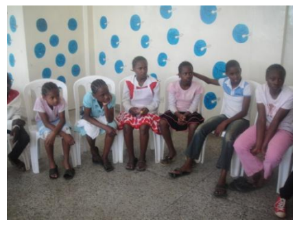
During a girls' counseling session

In a bid to encourage positive behavior the children were engaged in different life skills training sessions that went hand in hand with teaching sexuality, peer groups, biblical values on purity and self awareness. The sessions were categorized in relation to sex and age which were either conducted formally or informally through debates, talks and life skill sessions.