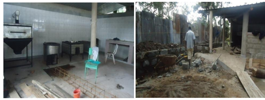
Kitchen under renovation

With the intervention of a new partner we were able to undergo a face lift on the buildings and structures which had been worn out overtime. Some of the activities undertaken were: repainting of the centers, installation of galvanized cookers and renovation of building