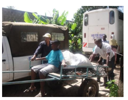
Boys transporting ballast for construction

As a way of nurturing our children's talents during the holidays we engaged them in industrious activities such as renovations, child care, paintings, food preparation, housekeeping, animal care and cultivation among others