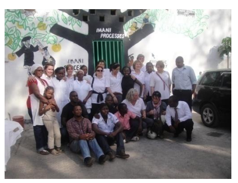
Visiting doctors from Netherlands

On a sad note, after trying all we could we lost to 6 babies who succumbed to health related issues.