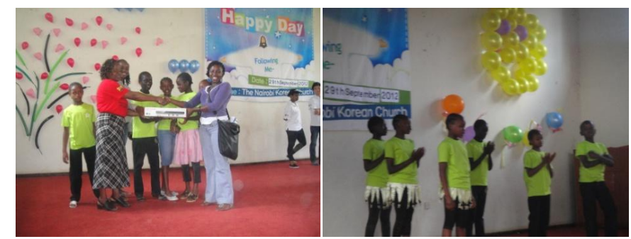
Children officer presenting the gift

During the school holidays we got to express our thoughts and feelings through" my flower, my message" initiative which gave the children an arena to convey an inspirational message by writing it on a flower pot for others to read.