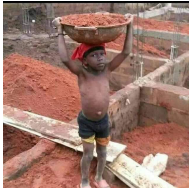
A CHILD IN A CONSTRUCTION SITE

In 2018, we reported over 29 cases to the authorities and took to court one case of child marriage/defilement. The judgment has not been given. The child was given to the school for one year.