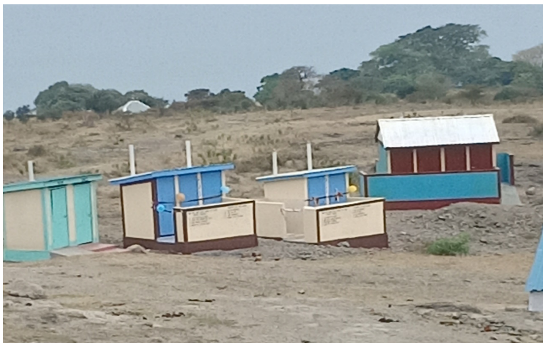
FIGURE 4 STATE AT EDDIE MEMORIAL SCHOOL

In our several meetings with the county government through the ministry of Education, we secured modern safe water storage and dispensing facilities for Kamasengre Primary school. The three water filtering units were awarded to this school as a way to help children get access to safe drinking water while they are in school. Water from Victoria Friendly Montessori dispensed using the facilities.