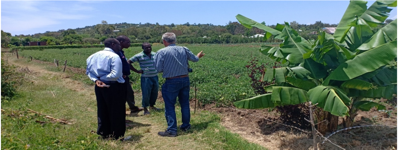
FIGURE 2 RAGO