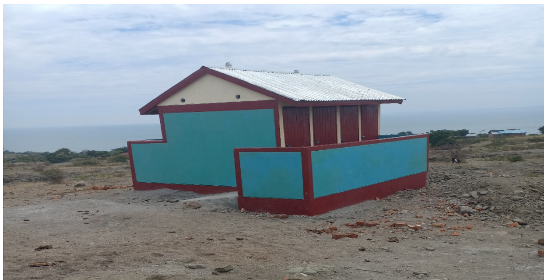
FIGURE 3 8 DOOR EFFORTS FROM MOCHO AT EDDIE