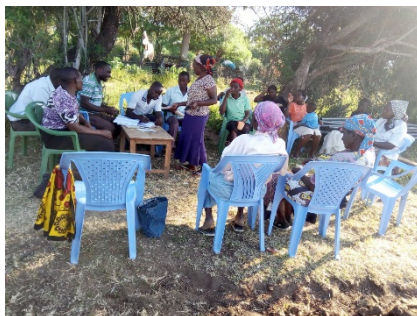
FIGURE 1 SILC SESSION

All the common interest groups have been organized as saving and internal loaning committee. Members in this model invest by saving more and earning little by borrowing.